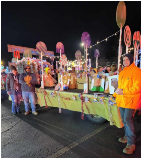
Head Start parents and staff in the Medina Parade of lights.

Thank you, especially to all of the parents for the donations and time it took!